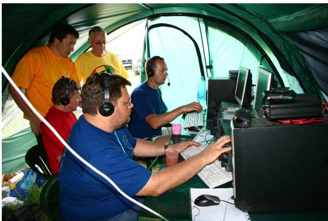
RA3AUU, G3SXW and a full-time referee observe two competitors, hard at it for the 8-hour contest

So, the organisers provide the tower, antennas, coax, tent, tables, chairs, generator & fuel. Rigs, switching, computers and everything else are brought by the Team. Some tents, I noticed had fans others an air-con unit! We were lucky with the weather as last year, apparently, they were nearly flooded out by torrential rains. Each team has two operators and two 100 watt transceivers. Organisers provide a traffic-light LED system to monitor output: up to 100 watts green, up to 105 watts amber and over 110 watts red. The full-time Referee must report any instances of the LED turning red. Each team also has a TX A/B blocker so that only one transceiver can transmit at the same time.