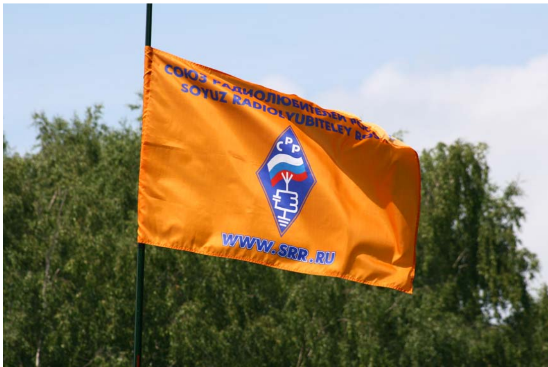
The SRR (Russian national society) flag mounted on a SteppIR vertical.